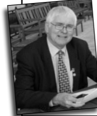
Sir Bob Russell MP

Tel: 506600 Magdalen Hall, Wimpole Road, Colchester CO1 2DE Email: info@bobrussell.org.uk www.bobrussell.org.uk