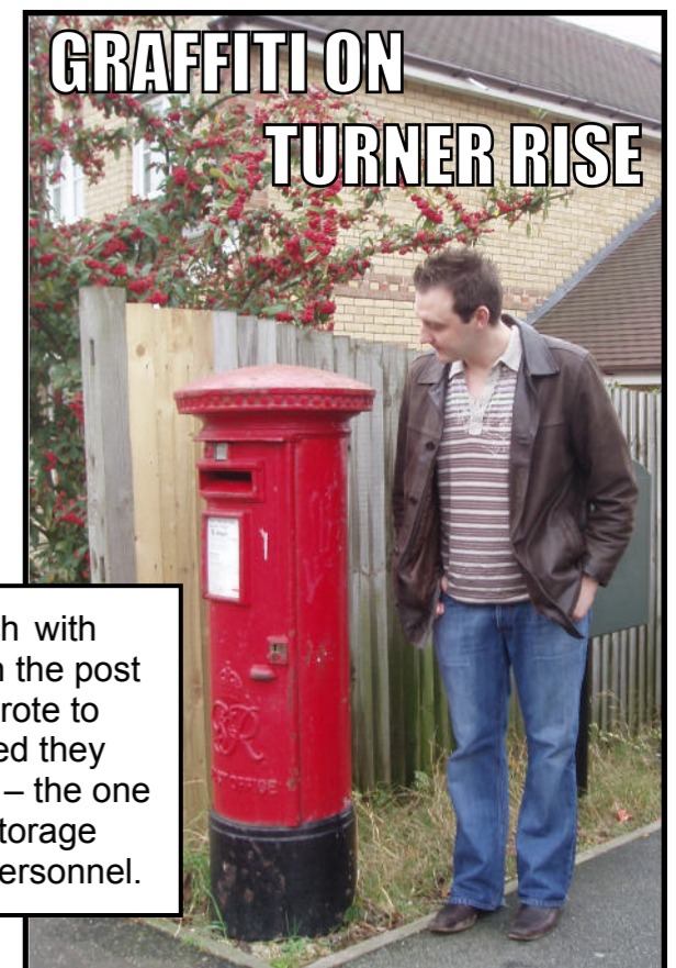
GRAFFITI ON TURNER RISE

Please let us know of issues in your area so we can try and help improve this and deal with the issues at source.